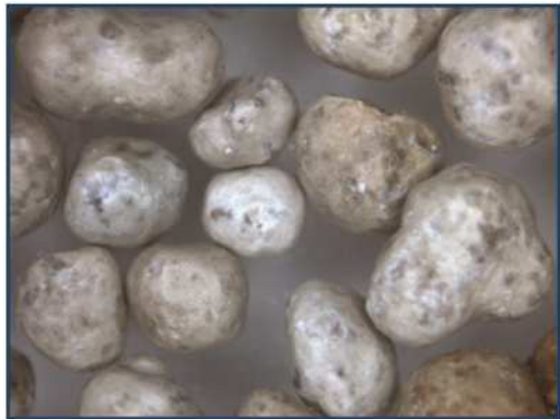
METABOLYS® BY-PASS LYSINE After 16 hours of ruminal exposure