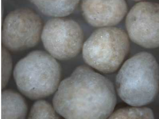
METABOLYS® BY-PASS LYSINE Raw Material