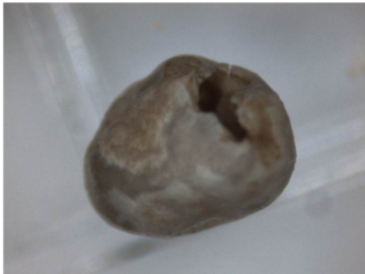
METABOLYS® BY-PASS LYSINE Post intestinal digestion